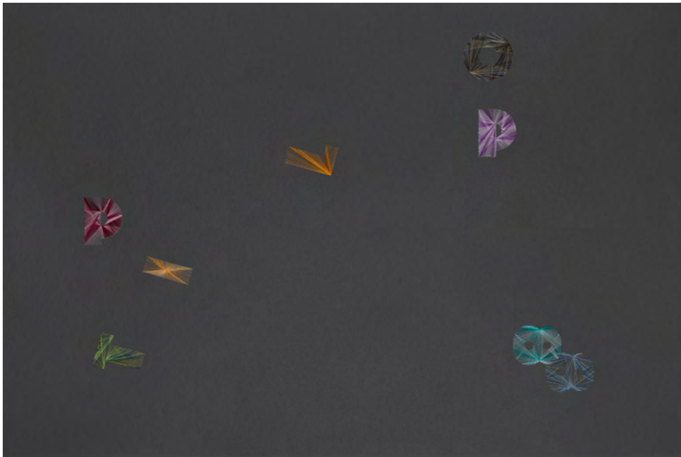
Pae White, Grayscale Double 8 , 2018, Handstitched cotton and rayon yarn on paper, 64 x 94.5 x 4.2 cm. © Pae White / STPI.

The GRAYSCAPES series (2018) similarly examines space. Using threads to create space on a two-dimensional plane, the material was expertly, almost surgically, sewed onto paper with the support of the workshop team. This created the same prismatic effect seen in her flocking words. Put together side by side, the undulating landscapes of floating letters and numbers impart a sense of lyricism, rhythm and movement. At the same time, there is the tension of struggling to come together, both within the canvas and from one GRAYSCAPE work to another.