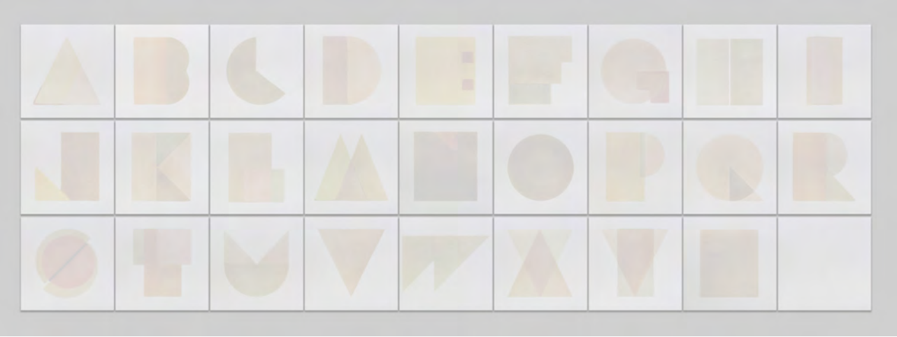
Pae White, MOTHERFLOCKER ALBINO , 2018/2019, Screenprint, multi-colour flocking, 27-part installation, 63 x 63 x 3.8cm each. © Pae White / STPI.