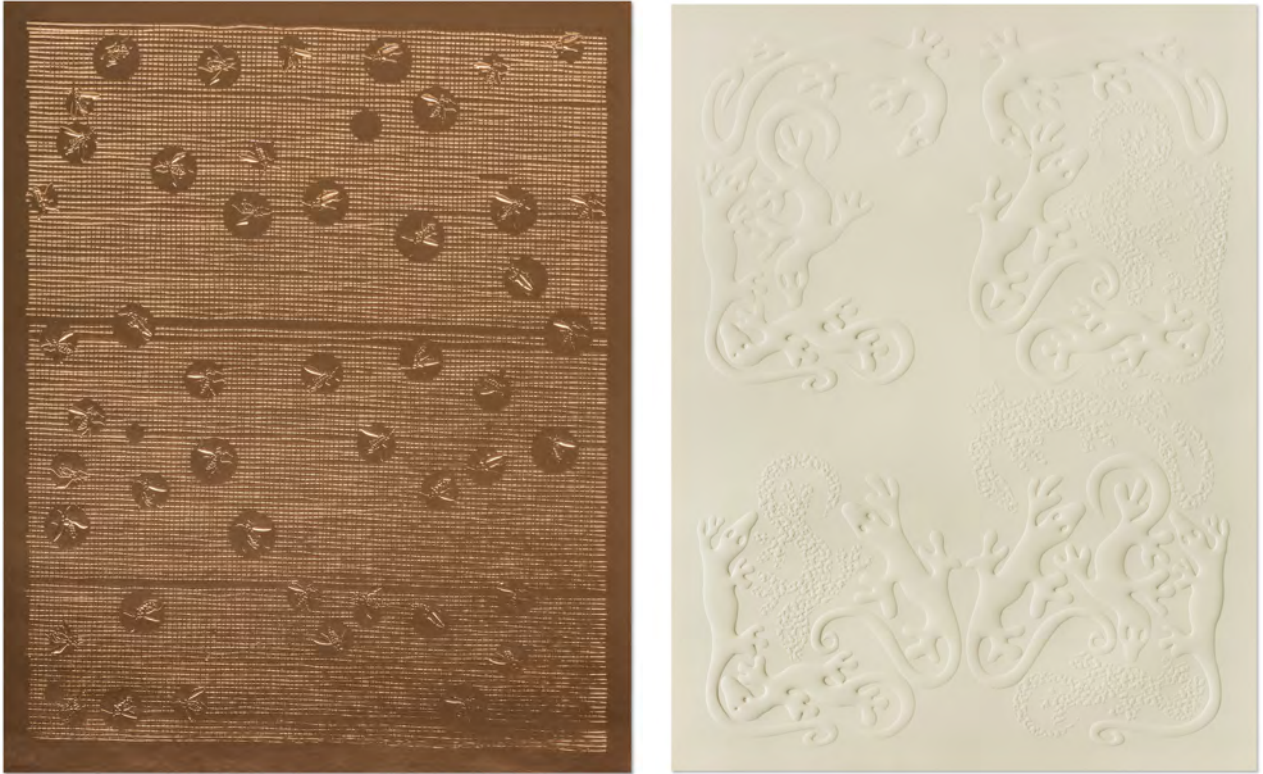
Pae White, (left) Hearing Things, fireflies (copper) , (right) Hearing Things, sallies (Touché) , (both) 2018, Embossing on coated paper, 72.7 x 51.5 x 3.8 cm.