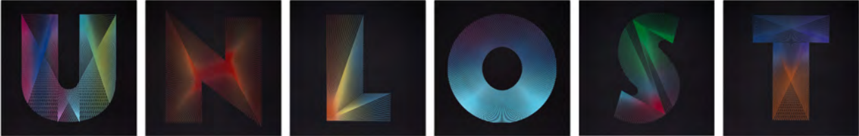
Pae White, UNLOST , 2018, Screenprint, multi-colour flocking, 6-part installation, 63 x 63 x 3.8cm each. © Pae White / STPI.