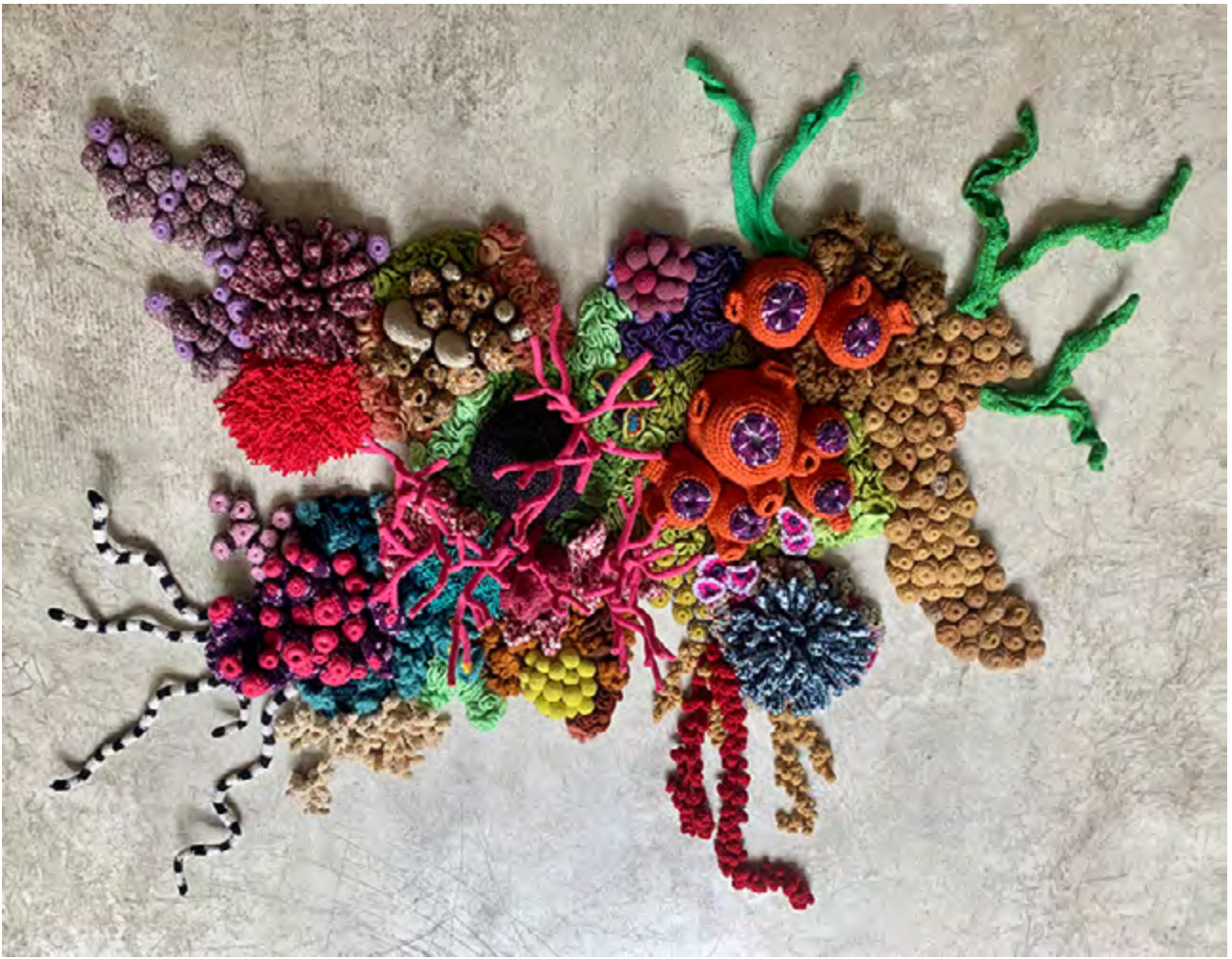
Mulyana , Coral Island Harmony #5 , 2016. Synthetic yarn, synthetic cotton, plastic web. 200 x 200 x 38 cm.