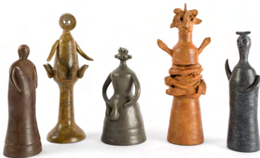
Dusadee Huntrakul , Monument for Mothers, Monument for Regenerative Labor Practice, Monument for Regenerative Agriculture, Monument for Waste Management and Consumption, Monument for Biodiversity , 2020, Bronze, 420 x 7.5 cm; 26.5 x 10.5 cm; 19.4 x 9.5 cm; 28 x 10.8 cm; 22.5 x 6.2 cm. Edition of 3.