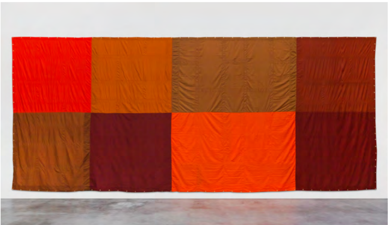
Rirkrit Tiravanija , untitled 2016 (nothing) , 2016. Saffron dyed cotton, thread, metal grommets. Dimensions variable.

The new integrated S.E.A. Focus to nurture appreciation of the region's art with a curated onsite experience, insider tours and virtual travels to international art spaces, and expert discourse in its third edition