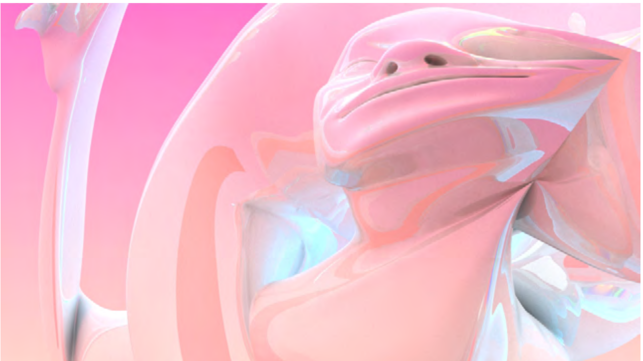
Tromarama , Remind me later , 2019. Single-channel video, sound, 4 min 59 sec. Sound by Riar Rizaldi.