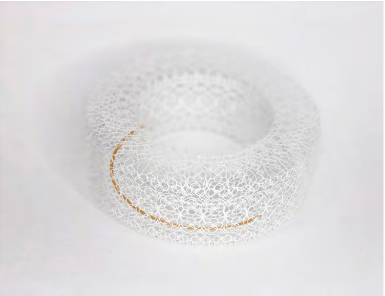
Ashley Yeo , Marigold , 2019. Hand-cut paper, 5 x 15 x 15 cm. © Ashley Yeo.