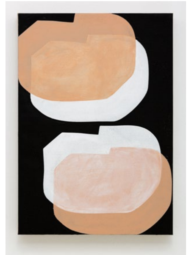
Edge Control #34, Surfacing, 2020, Acrylic on linen, 60 x 42 x 4.5 cm