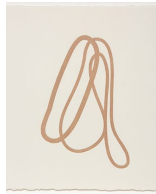
Heads or Tails , 2020, Relief print on paper, 30.5 x 30.5 x 4 cm