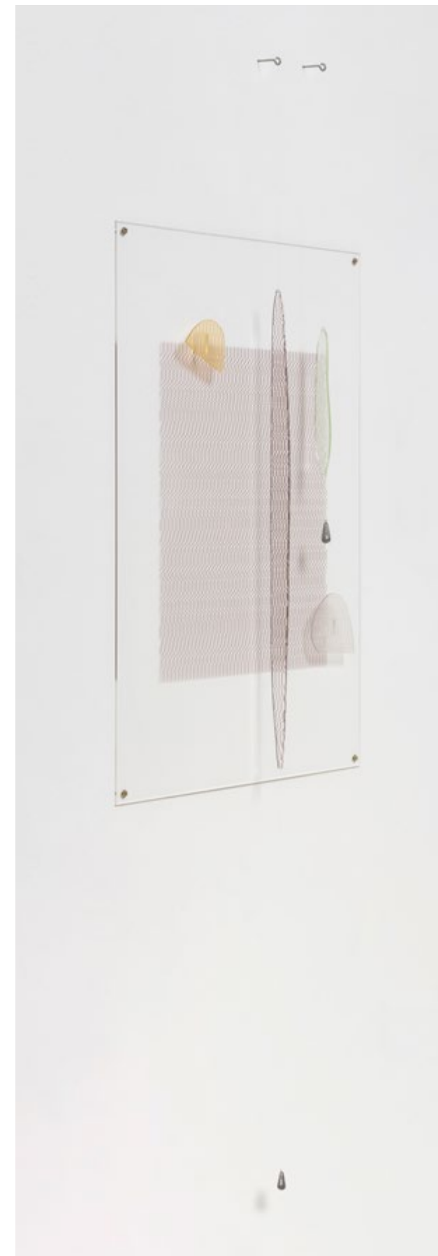
It Had To Happen, 2020, Screenprint on acrylic, 140.5 x 44 x 4 cm

Emma Phillips, Press & Media Relations, STPI - Creative Workshop & Gallery emma@stpi.com.sg | +65 6336 3663