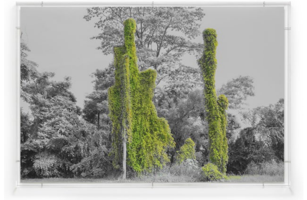
After the Flood #28, 2011 - 2019, Digital pigment ink print on photographic paper, hand-coloured with ink, 75 x 109 x 8 cm