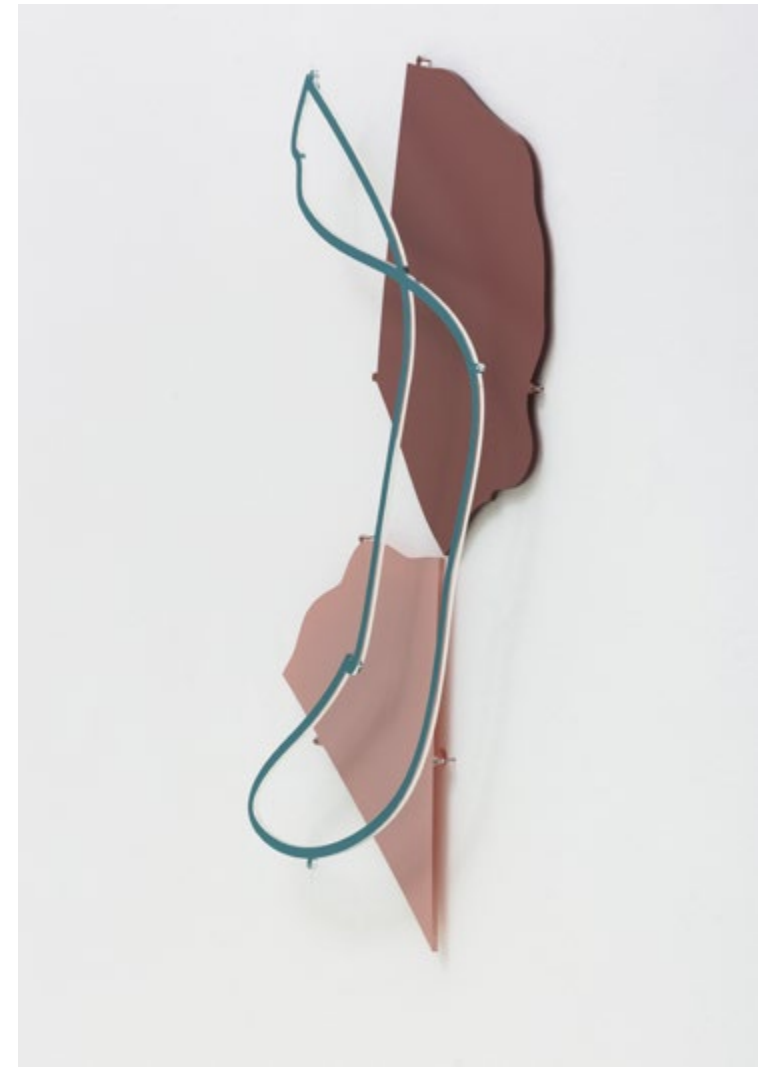
Pivot Point , 2020, Screenprint and rolled ink on acrylic, 122 x 70 x 5 cm