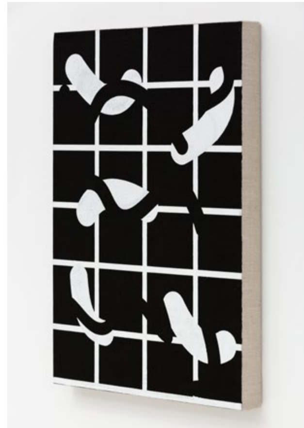
Edge Control #15, Soft Diplomacy, 2018, Acrylic on linen, 60 x 42 x 4.5 cm