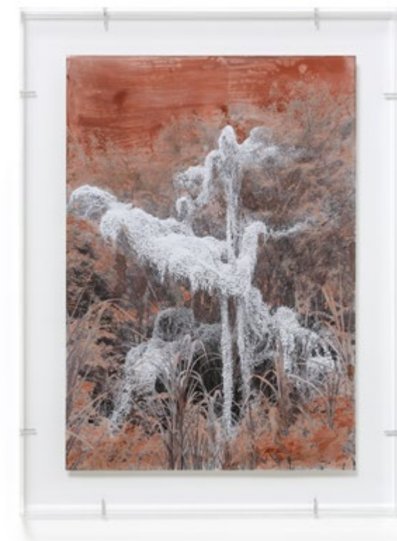
After the Flood #29, 2011 - 2019, Digital pigment ink print on photographic paper, hand-coloured with ink, 61.5 x 47 x 8 cm