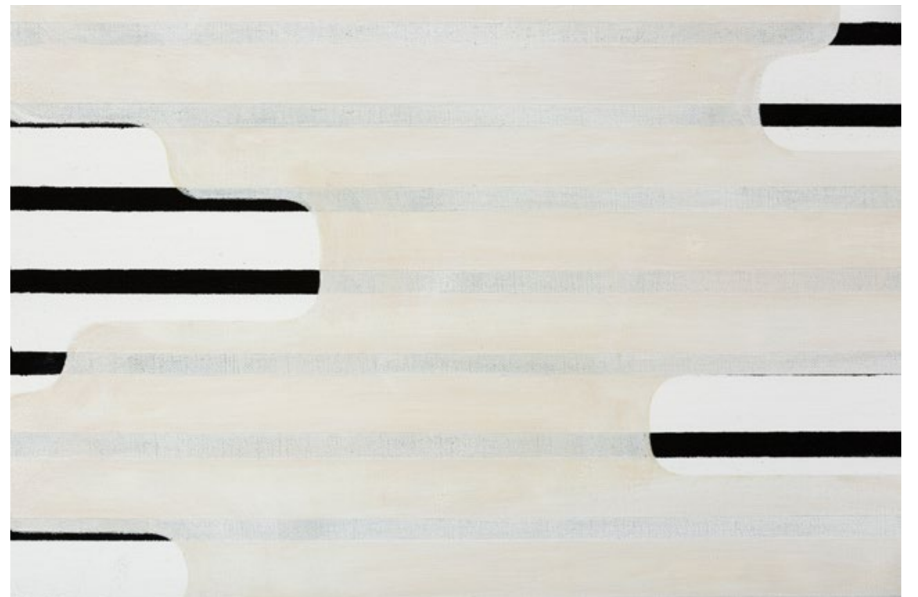
Edge Control #40, Notes on Smoke (detail), 2020, Acrylic on linen, 60 x 42 x 4.5 cm