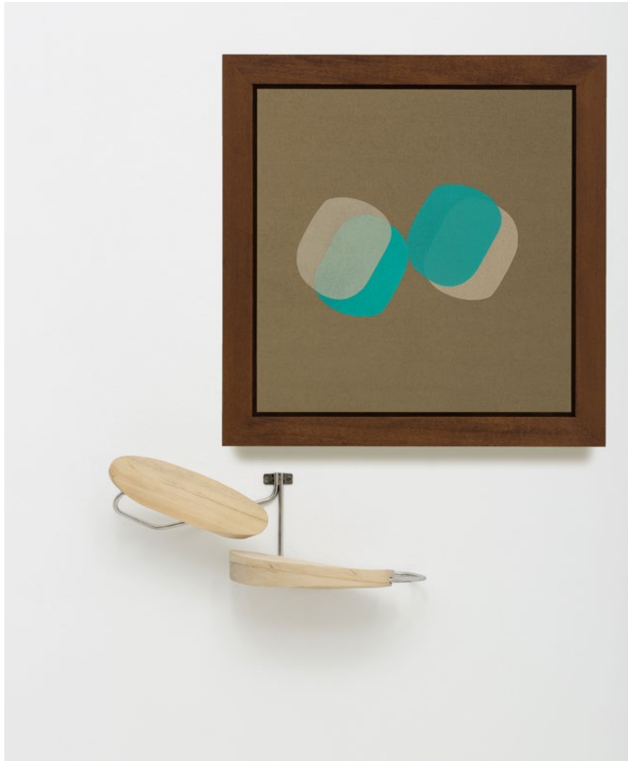
Surface on Surface; Swivel #11, 2017, Screenprint on linen; Damar wood and stainless steel bracket, 47 x 48 x 4.5 cm; 12 x 41 x 12.5