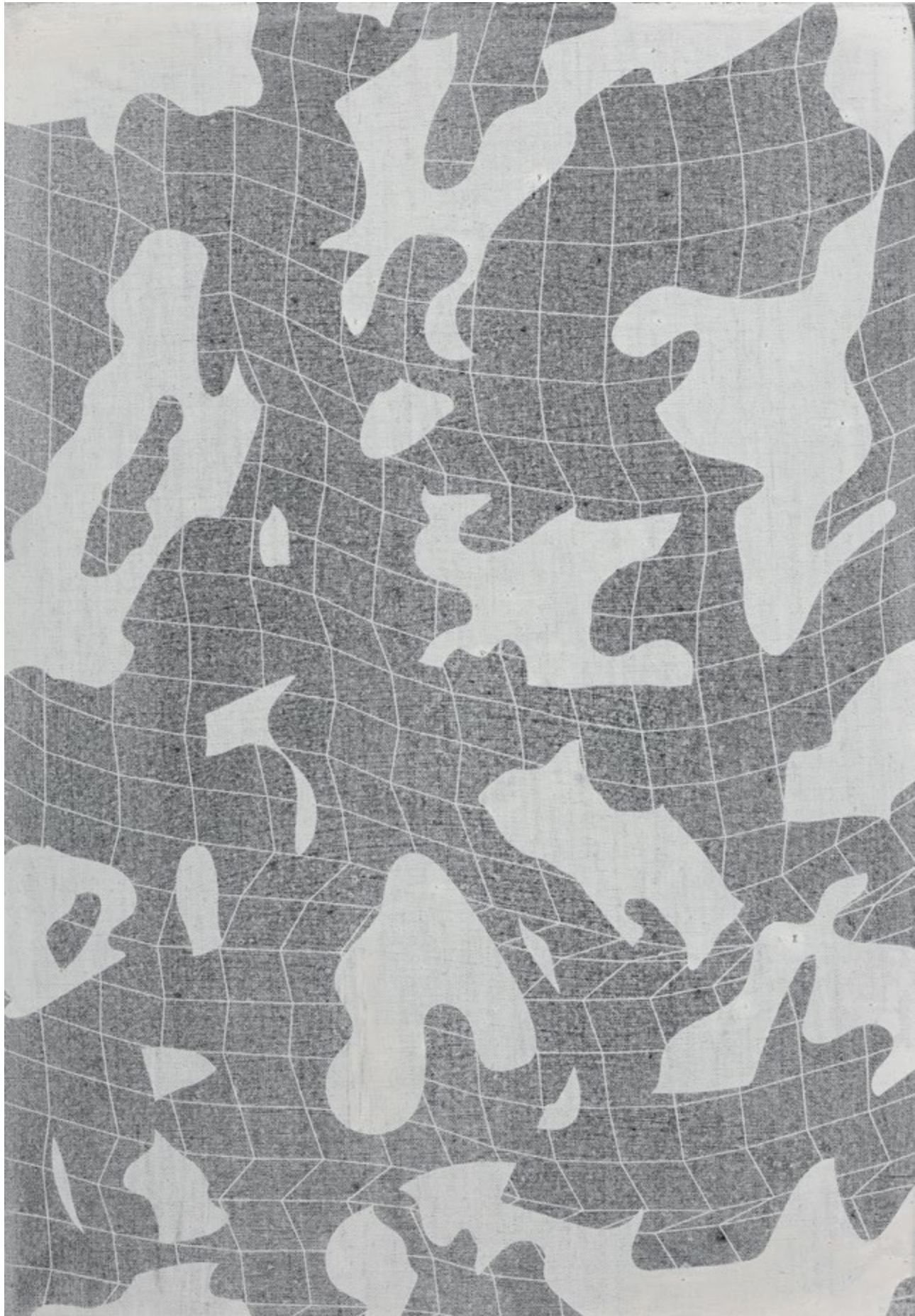
Edge Control #42, Second Nature (detail), 2020, Acrylic on linen, 60 x 42 x 4.5 cm