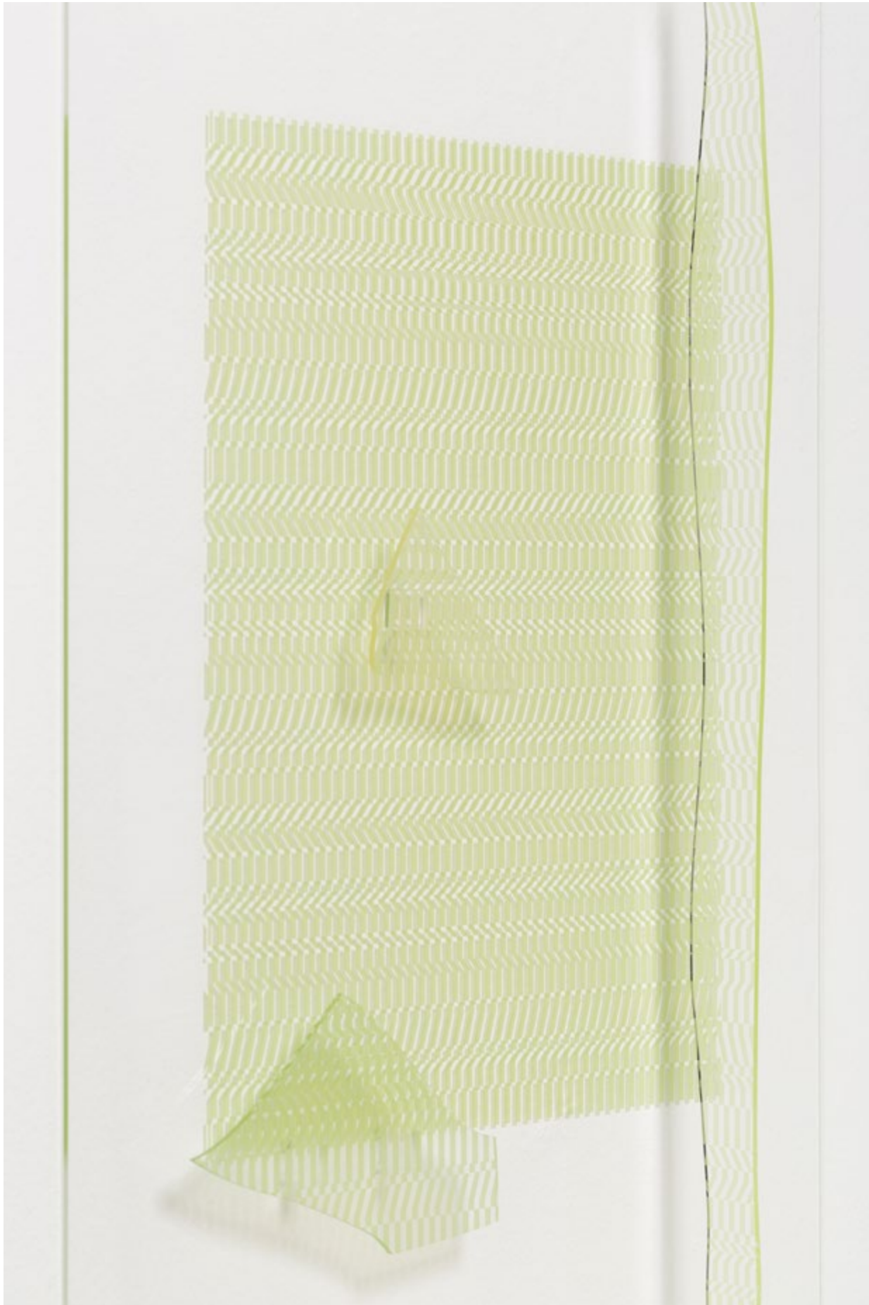
It Might've Happened (detail) , 2020, Screenprint on acrylic, 133.5 x 44 x 4 cm