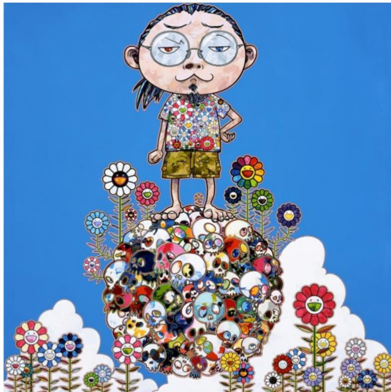
Me Among The Supernatural, 2013, Takashi Murakami, Acrylic on canvas mounted on aluminum frame, 1000 x 1000 mm

Takashi Murakami: From Superflat to Bubblewrap will see a multitude of both new and iconic pieces from Murakami, including the famed This Merciless World , a vibrant, colourful display of easily recognisable smiley flowers and skulls. If you find the faces of the flowers a tad familiar, it's because similar ones once adorned a coveted collection of Louis Vuitton purses.