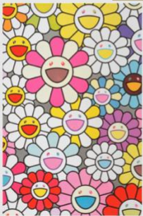
Takashi Murakami: From Superflat to Bubblewrap