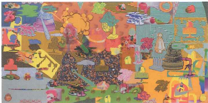
Endless, Nameless #1 , 2014, Collage, screen print, various, found objects, wooden panel, 122 x 244 x 4 cm. © 2014 Teppei Kaneuji / STPI. Image courtesy of the Artist and STPI

The STPI residency not only allowed him to expand on these existing concepts, it also incited new discoveries for Kaneuji, namely the cognizant relationship between the ‘formless’ image and the ‘tangible’ object. Here, flat manga illustrations of objects are rendered in tactile mediums like plywood, mirrors and thick handmade paper,