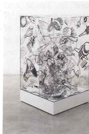
Model of something #8 , 2014 Screen print, acrylic boxes 120 x 80 x 80 cm © 2014 Teppei Kaneuji / STPI