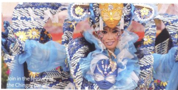
Join in the festivity at the Chingay parade

history. "I hope to re-establish a greater dialogue between the arts community and the public, and would like to see greater cross-cultural/disciplinary engagement amongst artists and art processes that actively includes the larger community," he expresses. The visual and performance artist, playwright, director, actor and educator will start at The Substation from February 17.