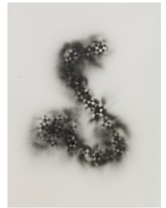
HAEGUE YANG Non-Folding - Dragged Geometry #1