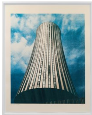
CARSTEN HÖLLER Slide House Project (Round Tower, Brazzaville)