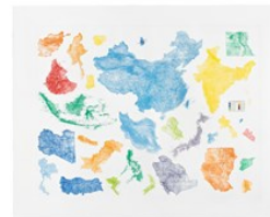
SAM DURANT Proposal for a Map of the World