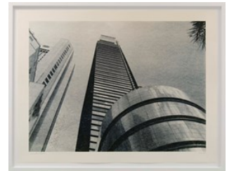
CARSTEN HÖLLER Slide House Project (Central Business District High Rise, Singapore)