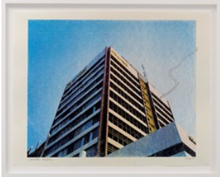
CARSTEN HÖLLER Slide House Project (Cedi House, Accra)

labyrinth beyond time and space, seeks his way out to the clearing, the math compass helps