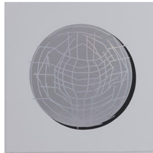
RIRKRIT TIRAVANIJA Moon rise - Time is setting - Tomorrow never arrives (detail)