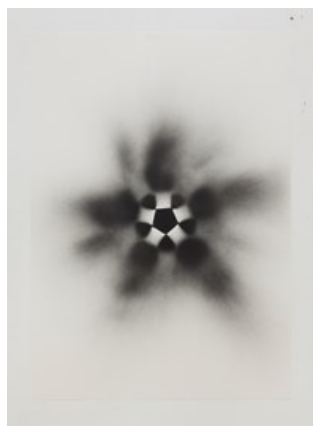
HAEGUE YANG Non-Foldings - Cosmic Explosion #4