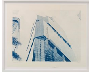
CARSTEN HÖLLER Slide House Project (Central Business District Corner House, Singapore)