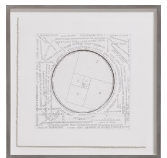
RIRKRIT TIRAVANIJA The Time Travelers gage, (end)gage A transformer designed to utilize the slight, wasted energies such as: The excess of pressure on an electric switch.