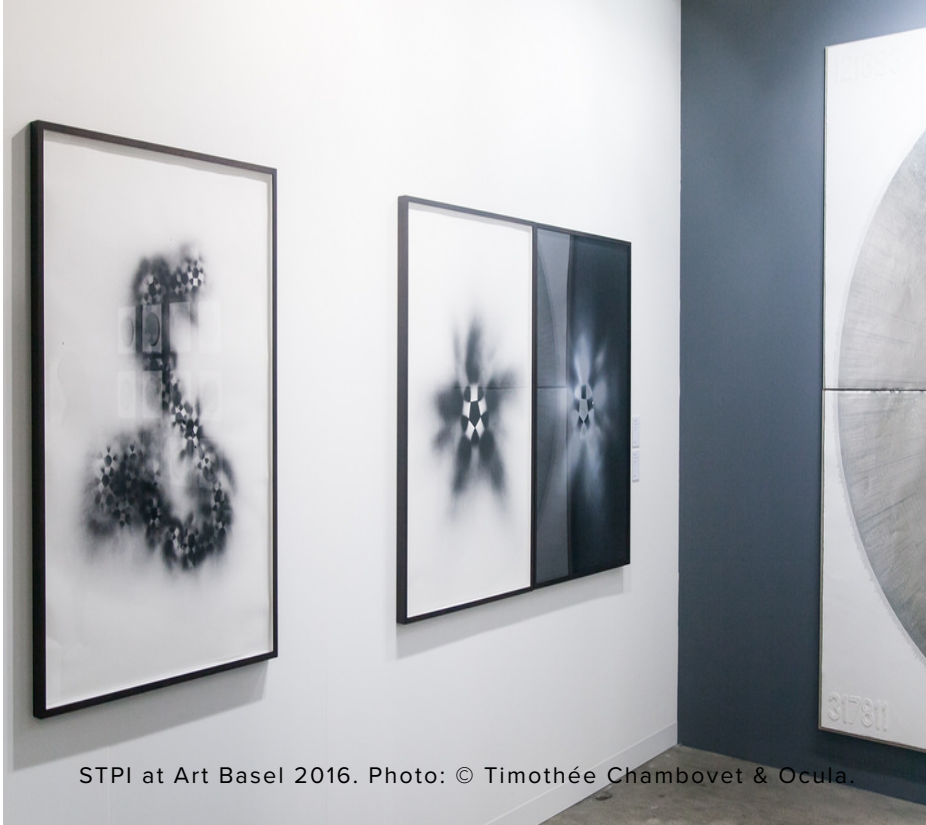
STPI at Art Basel 2016.