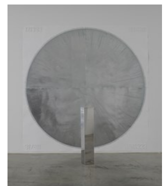
RIRKRIT TIRAVANIJA Seventh chapter: to all appearance, the traveler acts like a mediumistic being who, from the