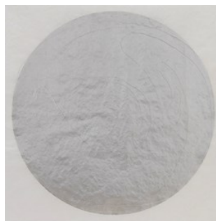
RIRKRIT TIRAVANIJA The hair that can predict the past, the present and the future