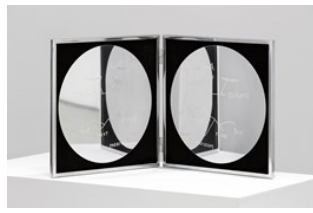
RIRKRIT TIRAVANIJA Untitled (The double moon at noon, Darwin's dilemma)