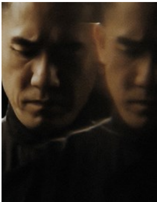
HO TZU NYEN The Nameless