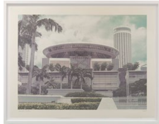
CARSTEN HÖLLER Slide House Project (Central Business District Airport Tower House, Singapore)