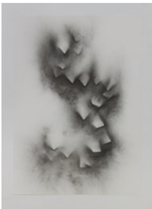
HAEGUE YANG Non-Folding - Geometric Tipping #43