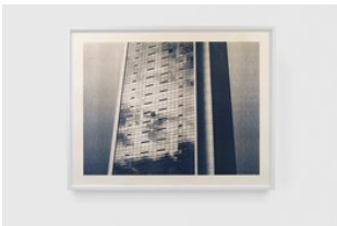
CARSTEN HÖLLER Slide House Project (River Reflective High Rise, Singapore)