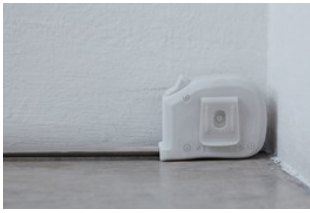
RIRKRIT TIRAVANIJA Time anarchy comes in small measured meters, matters, when oppression (clock) is apparently appearing