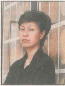
Artist Haegue Yang's (above) work (right) is displayed in the lobby of the Museum of Modern Art in New York.