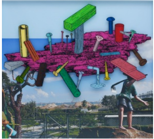
Teppei Kaneuji , Games, Dance and the Constructions (Singapore) #4-A , 2013 Screen print, archival inkjet print, plexiglass, cotton rag paper 96 x 104.5 x 4.5 cm