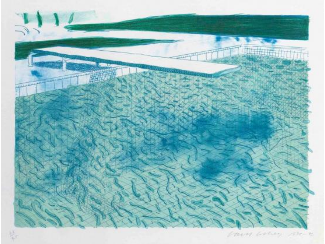
David Hockney, Lithograph of Water Made of Lines and a Green Wash , 1980.