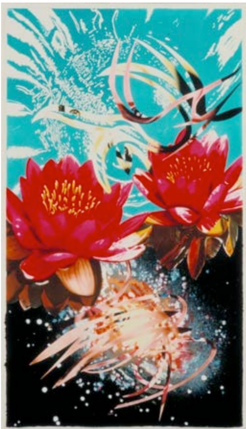
James Rosenquist , Sky Hole , 1989 Coloured pressed paper pulp, lithograph & collage 148.2 x 262.5cm