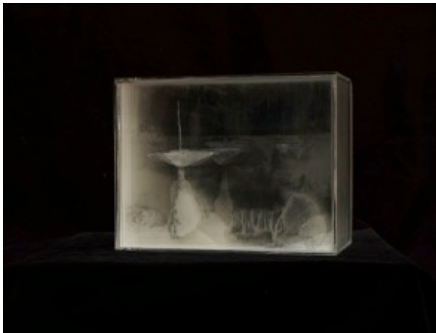
Donna Ong , In the deep: not all who wander are lost (I) , 2008 Cut out photoetching printed on Mitsu medium placed between acrylic sheets with drilled dots 16.8 x 22 x 9.8 cm