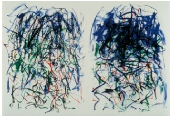
Joan Mitchell , Sunflowers II , 1992 Lithograph 145.4 x 208.3cm