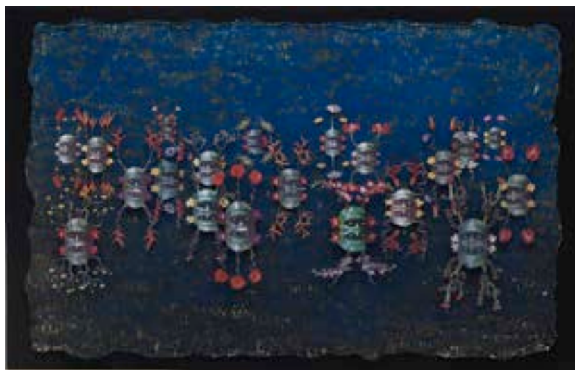
Ashley Bickerton , Green Reflecting Heads No.6 , 2006 Hand cut litho printed heads assembled with insect pins on colour pulped STPI handmade paper