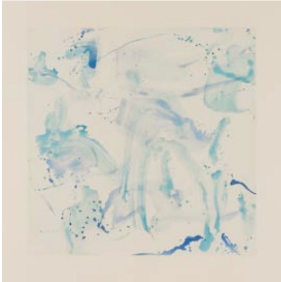
Suzann Victor , Twice Upon a Juliet III , 2015 Spit bite aquatint on Saunders 638 gram paper 150 x 150 cm