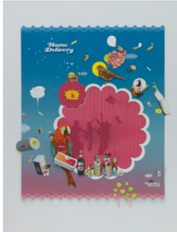
Thukral & Tagra , ( Home delivery ) Six days a week , 2009 Lithography, screen print, collage, hand cut, hand paint, misu paper, air brush, laser cut acrylic constructed on laminated STPI handmade stencil shaped paper, cast paper, pigmented paper pulp, and mechanised acrylic structure. 190 x 154 x 18 cm