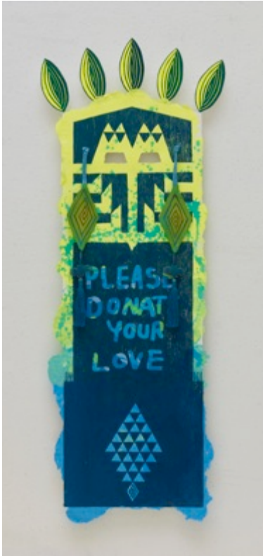
Eko Nugroho , Please Donate Your Love , 2013 Paper mask with screen print, relief print, collage, linen, found object, coloured shaped STPI hand made paper 130.5 x 49 x 3.5 cm