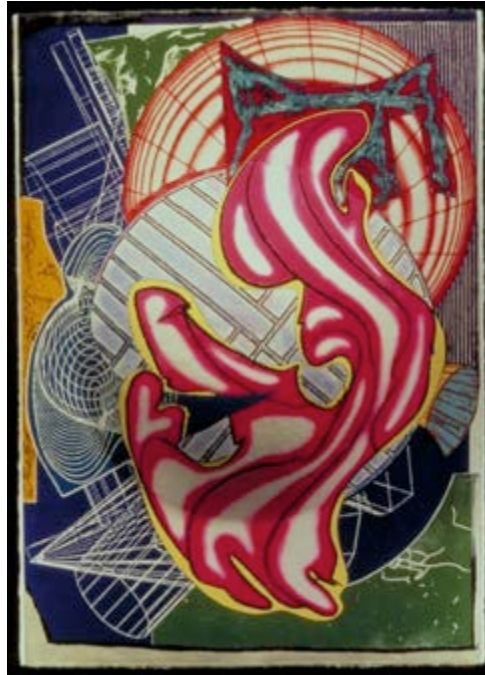
Frank Stella , Stubb & Flask kill a right whale , 1992 Hand-coloured etching, aquatint, relief, screenprint & stencil 134 x 186 x 15.2cm