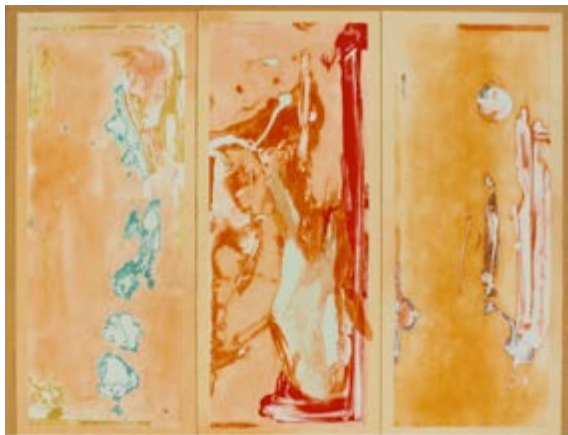
Helen Frankenthaler , ( Screen ) Gateway , 1988 Etching, relief, aquatint & stencil 205.7 x 251.5 x 172.1cm